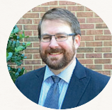
Minister: Kyle Rye